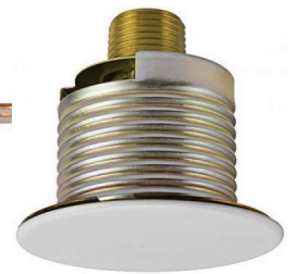
Pendent Type Sprinkler Upright Type Sprinkler Sidewall Type Sprinkler Concealed Type Sprinkler