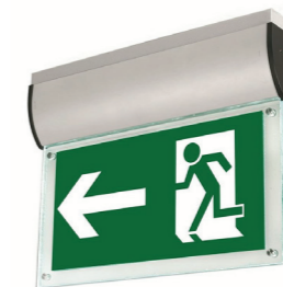
LED Emergency Exit Lights