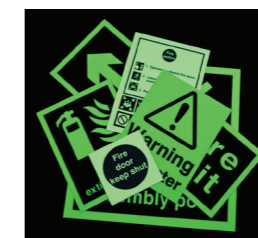
Photoluminescent Fire Safety Signs